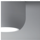
BC Wrinkled white