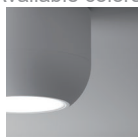
BC Wrinkled white