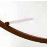
wall or ceiling details