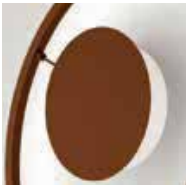
wall or ceiling lamp canopy version