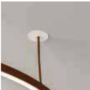
wall or ceiling lamp recessed version