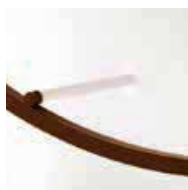
wall or ceiling details