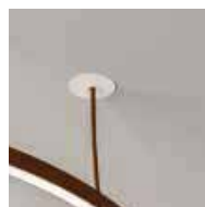
wall or ceiling lamp recessed version