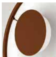
wall or ceiling lamp canopy version