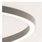
AN Anthracite grey

-sound absorbing option upon request- for more information see www.axolight.eu/u-light/u-light-sound-absorbing.pdf