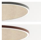
Sound absorbing option upon request

EELc (Energy Efficiency Label compatibility) contain built in LED lamps that cannot be changed: A, A+, A++