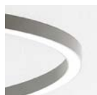
AN Anthracite grey