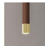
13 rust brown wrinkled final polished gold