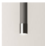
10 anthracite grey wrinkled - final black polished nickel