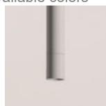
07 matt white RAL 9016