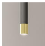
11 anthracite grey wrinkled - final polished gold