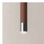
12 rust brown wrinkled final black polished nickel