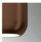
BR Matt bronze