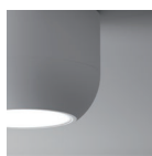
BC Wrinkled white