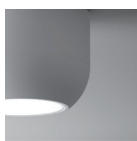
BC Wrinkled white