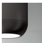
NI Matt nickel

EELc (Energy Efficiency Label compatibility) contain built in LED lamps that cannot be changed: A, A+, A++