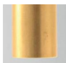
OT Natural brass